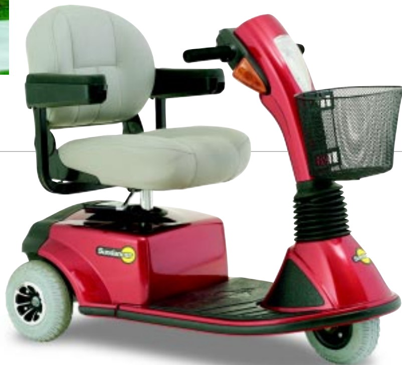
SC2000 Sundancer® 3-wheel scooter shown in Candy Apple Red

Stylish Design & Premium Performance ...at an Excellent Value