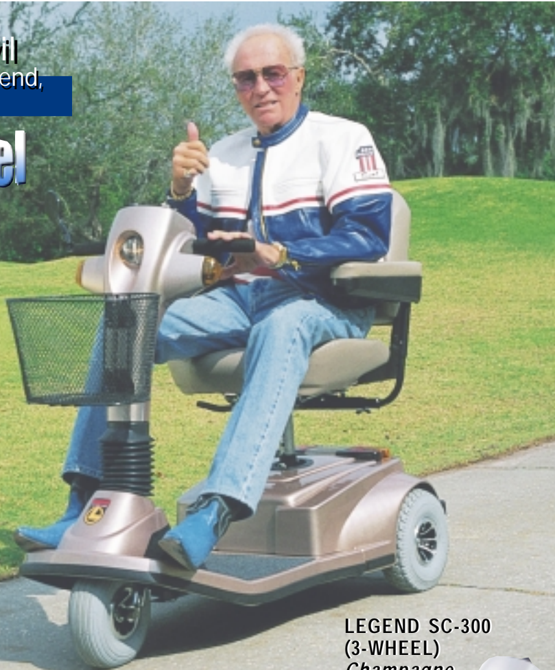
LEGEND SC-300 (3-WHEEL) Champagne

The best luxury scooter value available today!