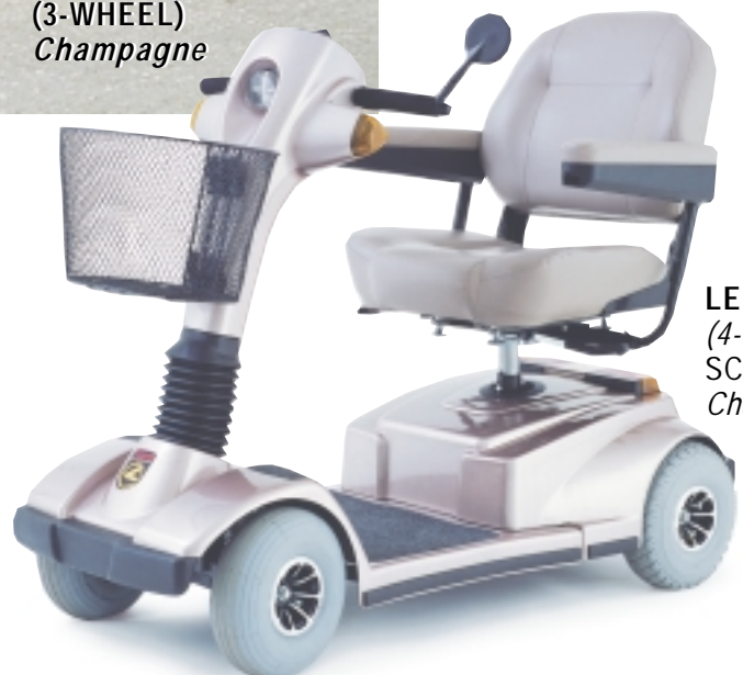
LEGEND (4-WHEEL) SC-340 Champagne

The Legend delivers a stylish, contemporary design that is loaded with standard features including full front and rear suspension, front headlight and full lighting package, sliding seat, front basket, rearview mirror and an infinitely adjustable tiller. The Legend then combines this style and great feature package with smooth and quiet indoor operation as well as the power, range and stability needed for incredible outdoor use - offering you unparalleled overall value and performance.