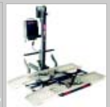
Power chair lift with straps

These lifts are compatible with the Jet™ 3 Ultra.