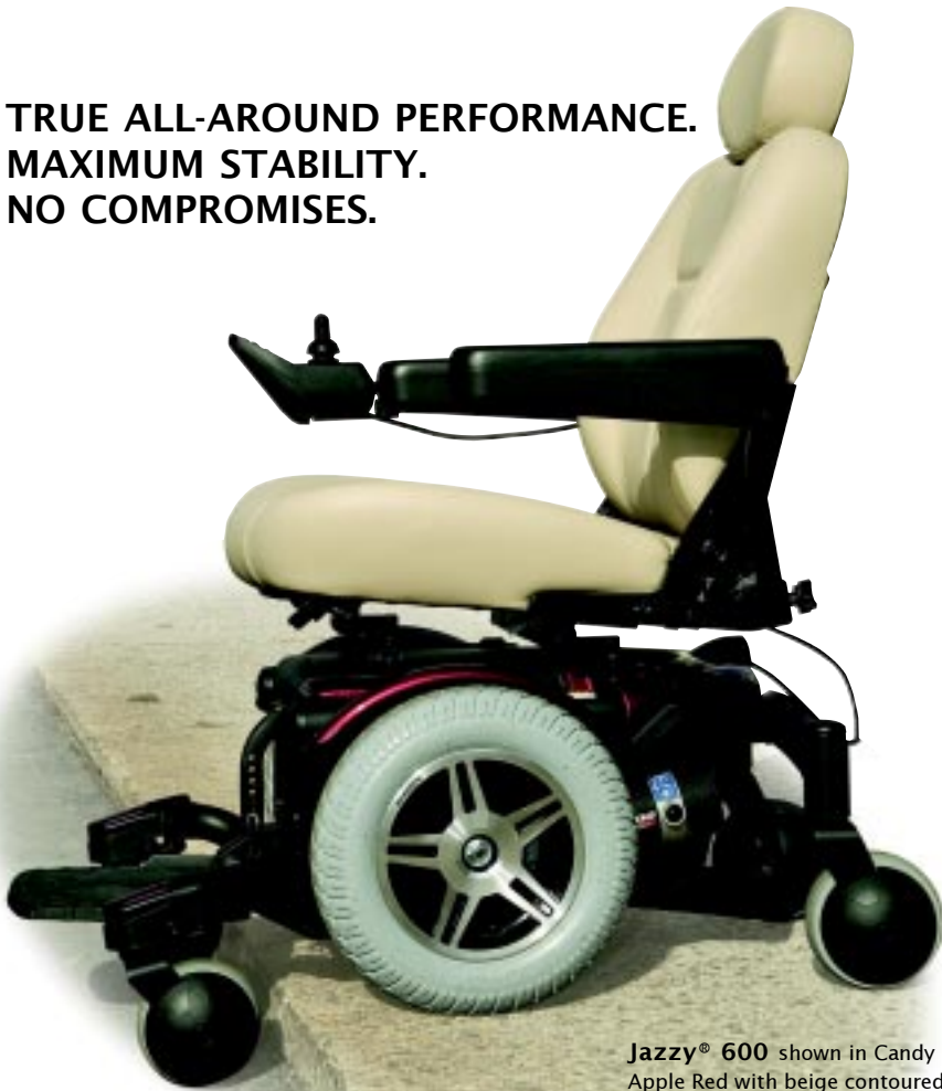
Jazzy® 600 shown in Candy Apple Red with beige contoured high-back seat, foot platform and Pride Flight controller.

TRUE ALL-AROUND PERFORMANCE. MAXIMUM STABILITY. NO COMPROMISES.