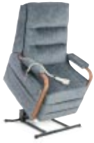
GL-310 1 3-Position Medium to Large