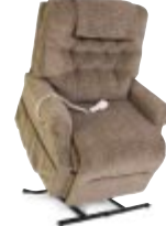
GL-545 2 3-Position Extra-Large Chaise Lounger