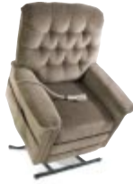
GL-358M 3-Position Medium to Large