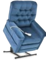
GL-358L 3-Position Large to Extra-Large