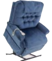
GL-555 2 2-Position Extra-Large Chaise Lounger

500 lbs. Weight Capacity 600 lbs. Weight Capacity