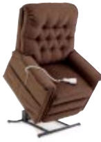
GL-58 2-Position Medium to Large