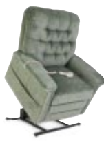
GL-358S 3-Position Petite